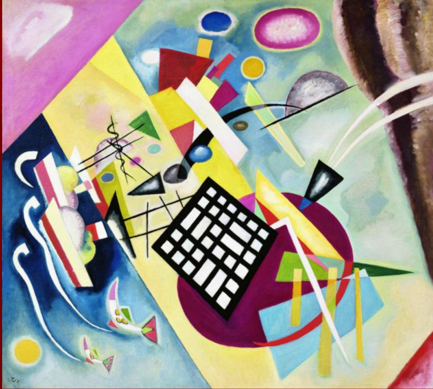
"Black Grid". 1922

You will listening to music while you work and will only use elements of art such as value, color, line, and shape in an abstract and expressive way.