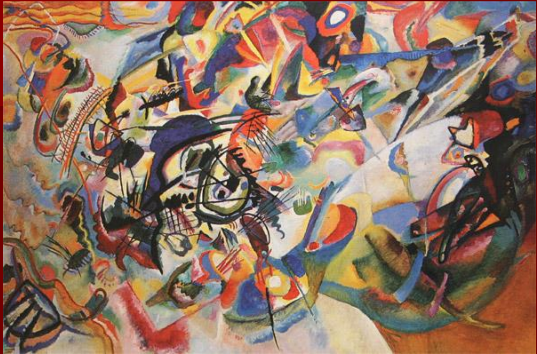
"Composition VII". 1913