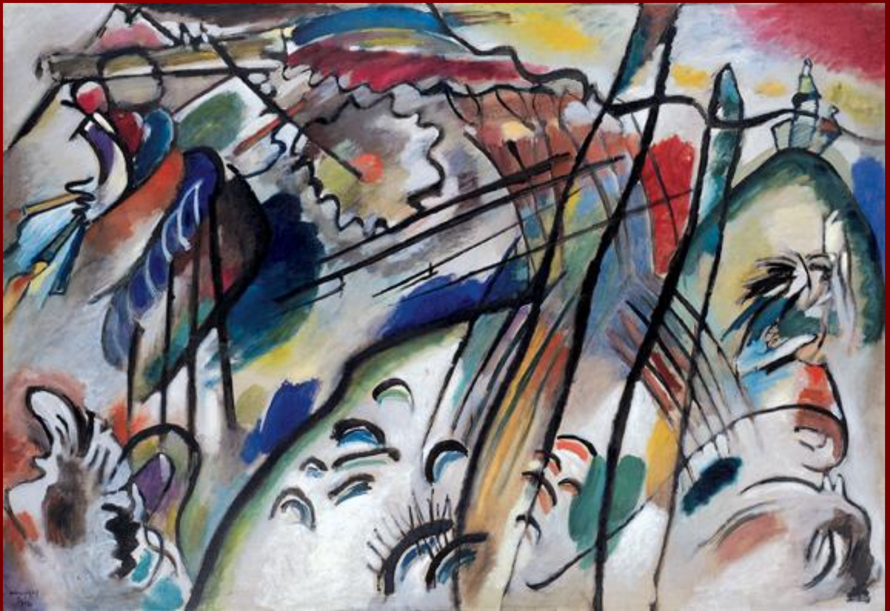
"Improvisation 28". 1912