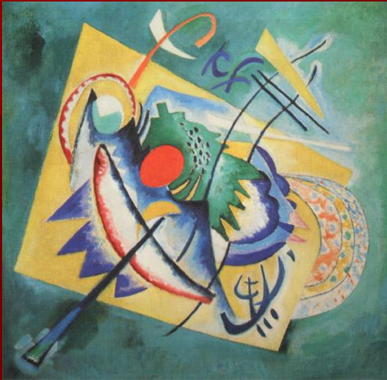
"Red Oval". 1920

The shapes he was most interested in were the circle, triangle and rectangle. He thought the triangle would cause aggressive feelings, the square would cause calm feelings, and the circle would cause spiritual feelings.